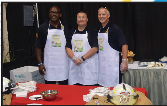
(L) Shreveport Fire Department serving up Pulled Pork!