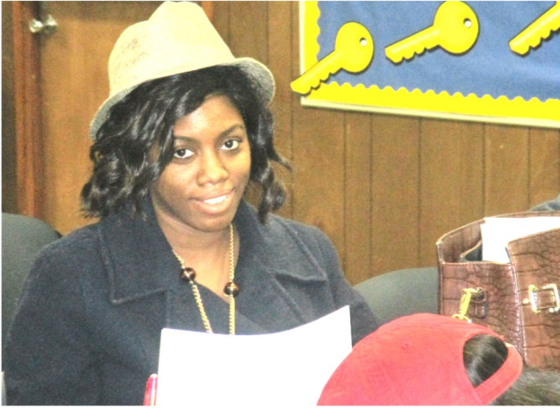
BUDGET WELL WORKSHOP PART 1