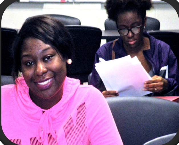
SUCCESSFUL STUDY HABITS WORKSHOP