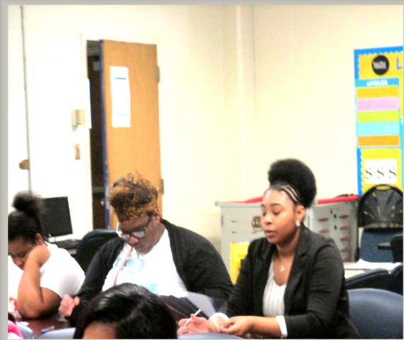
BUDGET WELL WORKSHOP PART 2