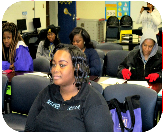
TEST TAKING WORKSHOP