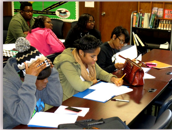
Budget Well- Bank It, Part 1 Workshop