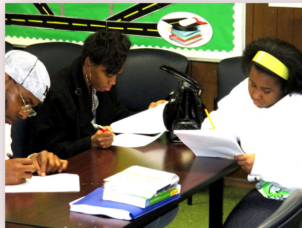
How to Deal With Stress/Time Management Workshop

Student Support Services (SSS/TRiO) welcomes back our students with open arms. We hope you had a wonderful holiday break and are ready to start the spring semester with a bang. SSS/TRiO is always trying to find ways in order to help our students gain the most from their college experience.