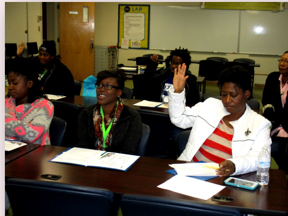
Budget Well-Bank It, Part 2 Receipts Workshop