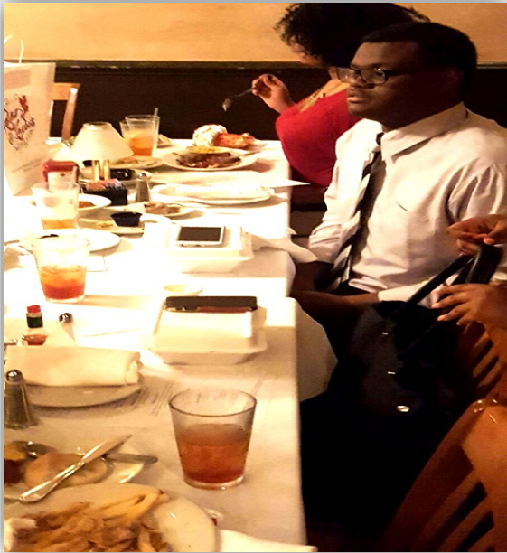
SSS Students Etiquette Class at Ralph and Kacoos