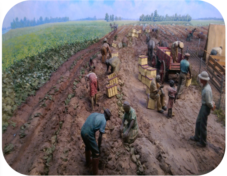
SSS Students visit Louisiana State Museum and ArtSpace for Cultural Events