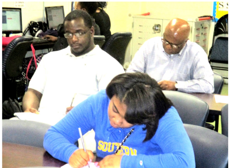
Financial Literacy Workshop