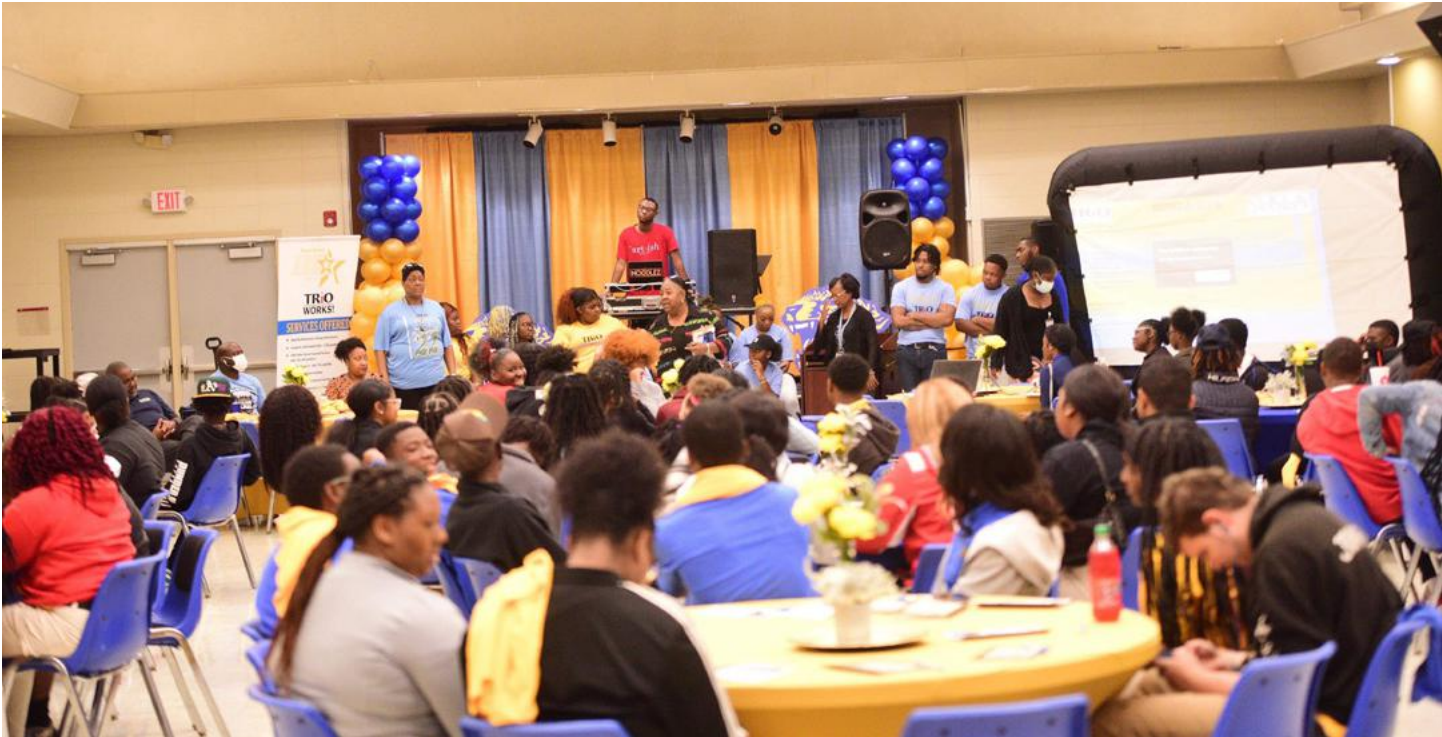
PICTURED: CADDO PARISH HIGH SCHOOLERS ENJOYING THEIR WELCOME TO SOUTHERN UNIVERSITY AT SHREVEPORT BY THE TRIO EDUCATIONAL TALENT SEARCH PROGRAM TEAM

Once again, TRiO's Educational Talent Search (ETS) Program had a very successful SUSLA Annual College Tour and FAFSA workshop! On October 4-6, 2022, ETS hosted the following high schools: Booker T. Washington, Green Oaks Performing Arts Academy, Red River, Magnolia, Arcadia, and Woodlawn Leadership Academy. The 11th and 12th-grade students took an extensive tour of Southern University at Shreveport. The staff from Student Affairs and Enrollment Management, Financial Aid, Students Support Services, Student Activities, and the SGA assisted the ETS staff in hosting visiting students. The members of the SUSLA's cheerleading squad had a dance contest with different dance groups from the visiting schools. This experience allowed our visiting students to meet with SUSLA's staff and complete the Free Application for Federal Student Aid (FAFSA).