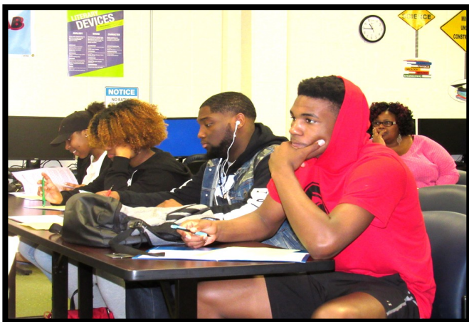
Best Way to Retain Test Taking Skills Workshop