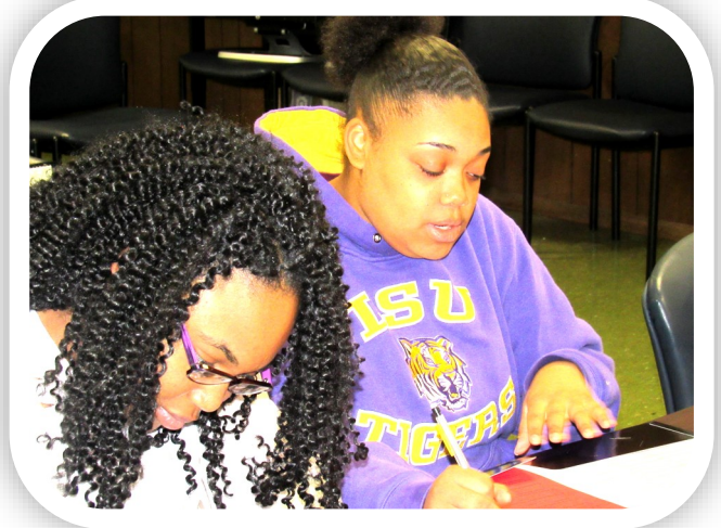
Breaking Bad Study Habits Workshop