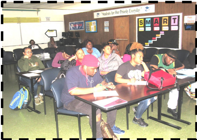
How to Make it on a College Budget Workshop