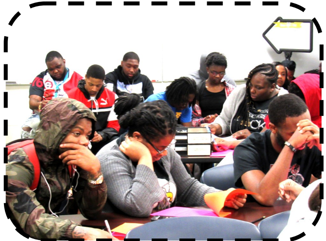
Financial Literacy Workshop