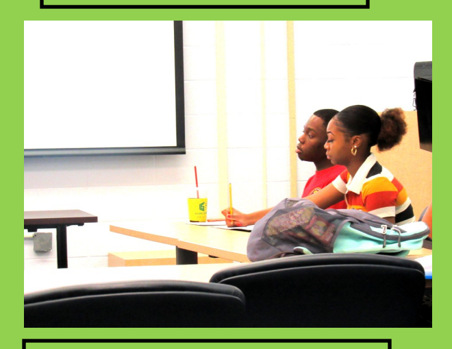
Dealing with College Stress Workshop