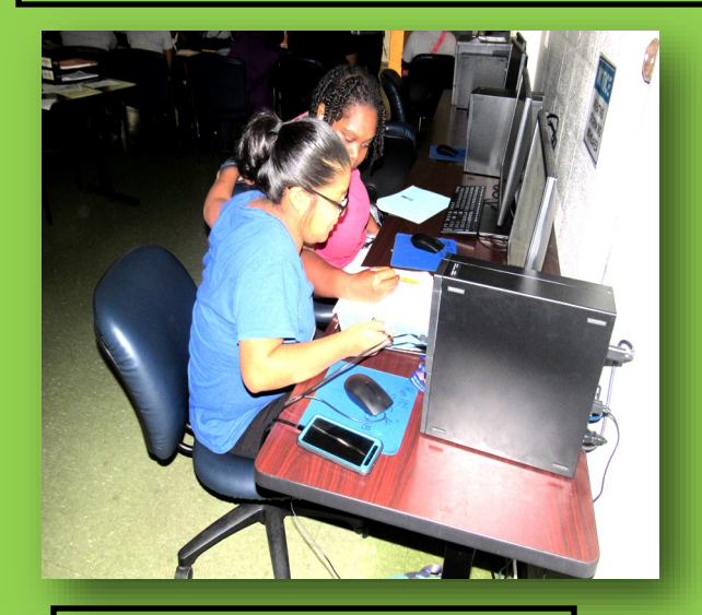
Students in the tutoring lab