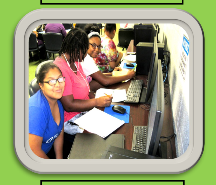
Math Anxiety Workshop