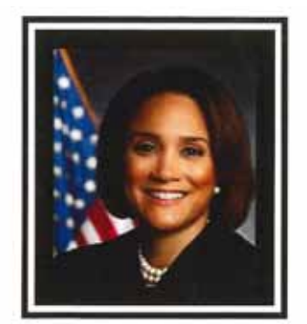
JUDGE REGINA BARTHOLOMEW-WOODS Fourth Circuit Court of Appeals, New Orleans, LA