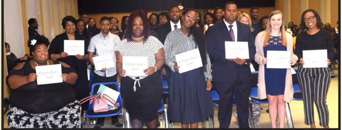
Chancellor's List (4.0)