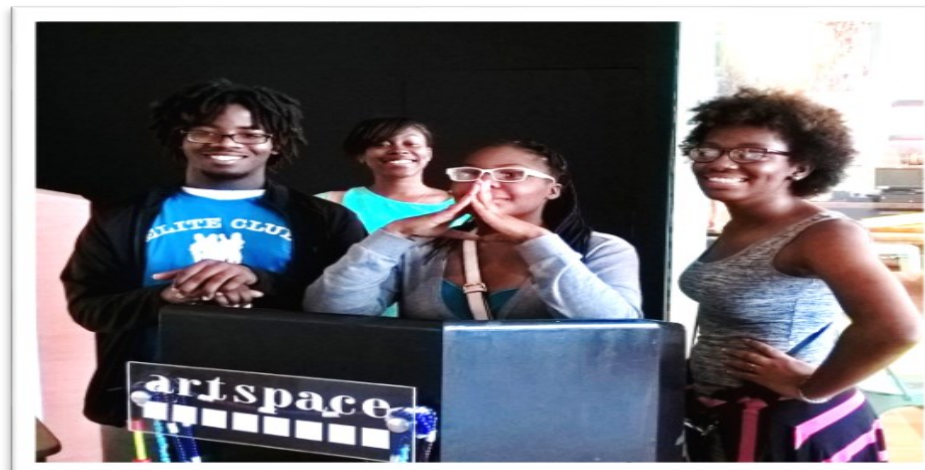
Southern University Museum of Art at Shreveport

artspace Your Destination for Arts, Food & Fun! 710 Texas St. Downtown Shreveport (318) 673-6535 / 318-673-6500